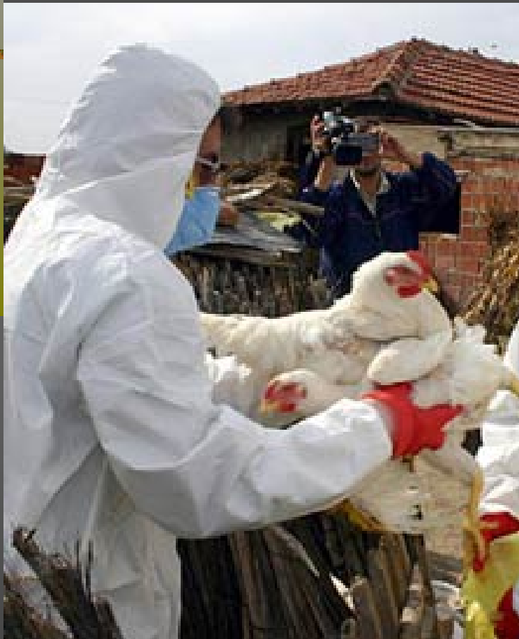
AP Photo/Anatolia/Emre Umurbilir, 6/21/06